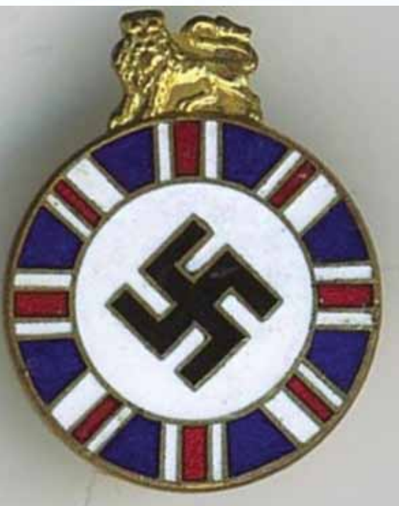
(top) Lapel badge for 'The Link', one of the pro-German groups that Dorothy Eckersley was active in, having joined it in 1937 following a visit to Germany.